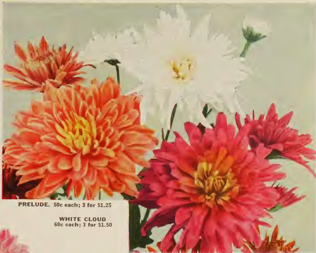
PRELUDE. 50c each; 3 for $1.25